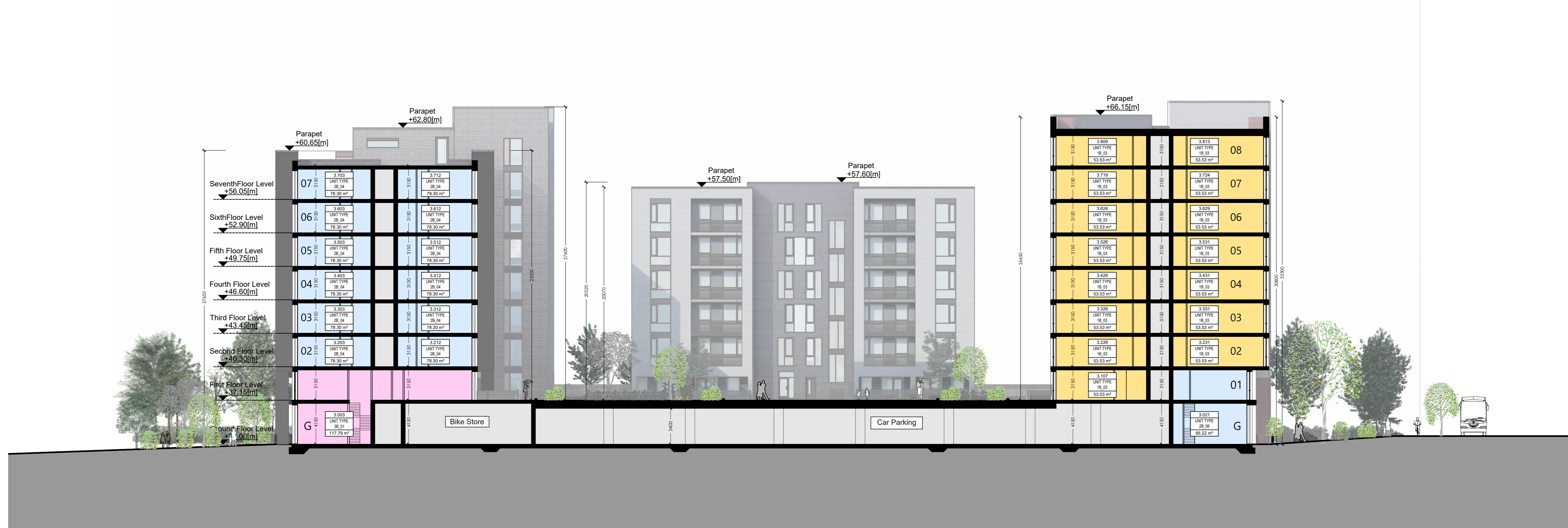
Section BB - Block 3 Scale 1:200 @A0